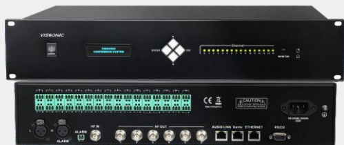
VIS-VLI700A-4/8/16 Digital IR infrared transmitter