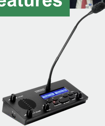
VIS-INT64 64 Channels Interpreter Desk