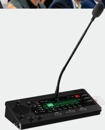
VIS-INT64-P 64 Channels Interpreter Desk