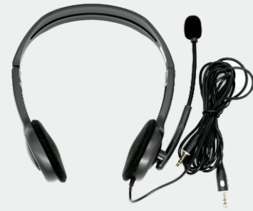
VIS-HPI 3.5mm headphone with MIC