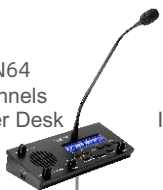
VIS-IN64 64 Channels Interpreter Desk