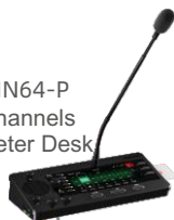
VIS-IN64-P 64 Channels Interpreter Desk