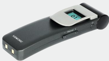
VIS-VLI703A-4/8/16/32 Digital IR receiver