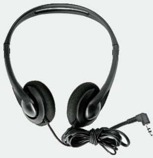
VIS-HPD 3.5mm headphone