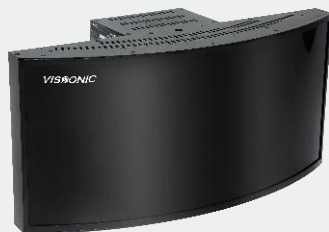
VIS-VLI701A Digital IR Infrared Radiation Unit