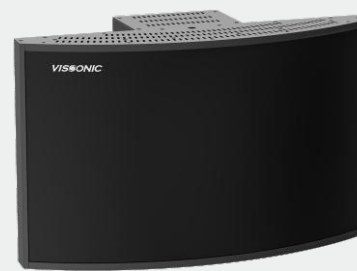
VIS-VLI701B Digital IR Infrared Radiation Unit