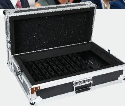
VIS-TC50A Receiver charging and storage case