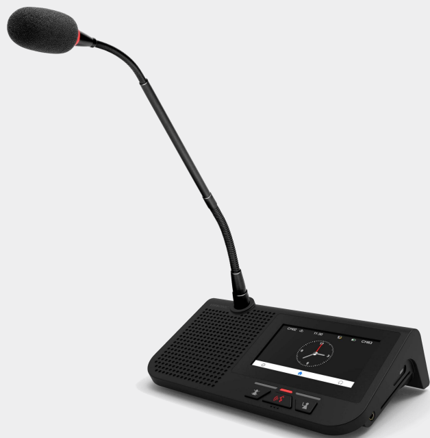
VIS-MAU-T Multi-Media Wired Touch Screen Unit